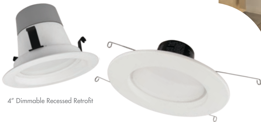
4" Dimmable Recessed Retrofit